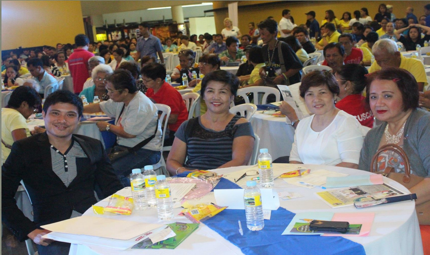
The speakers' team with a community in Muntinlupa City, Metro Manila