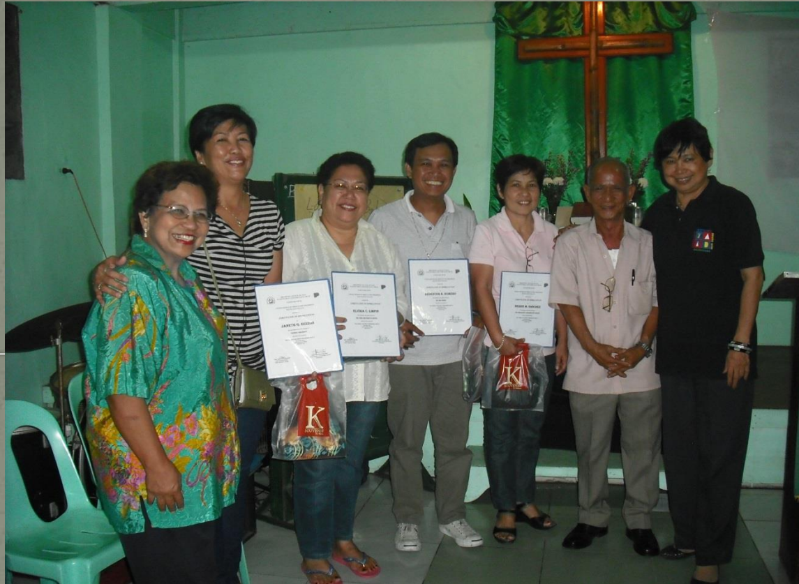
The speakers' team, ever ready with their mission.