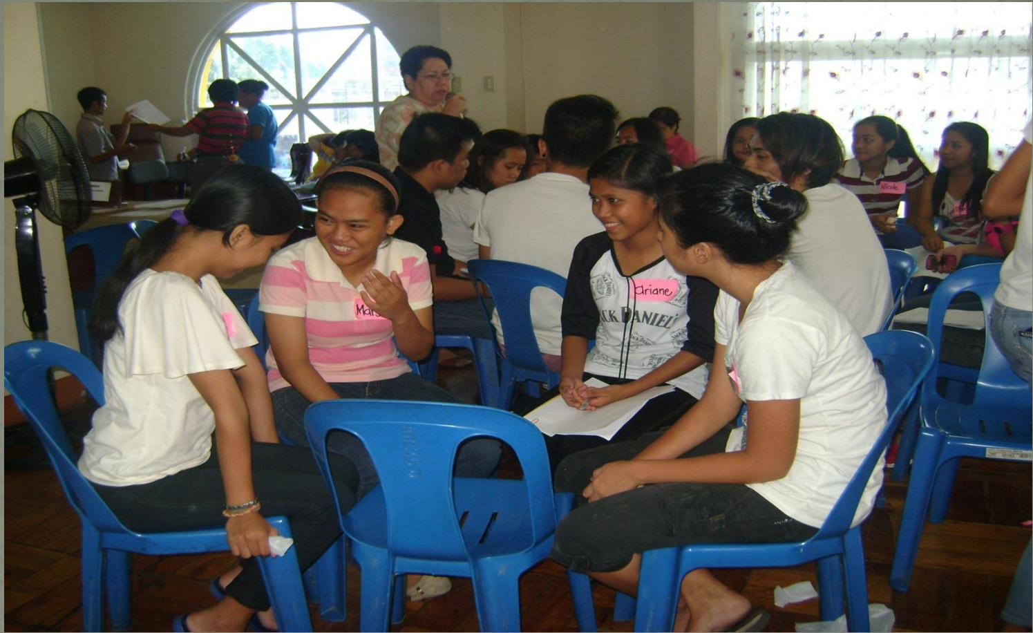
Youth participants prepare a plan of action.