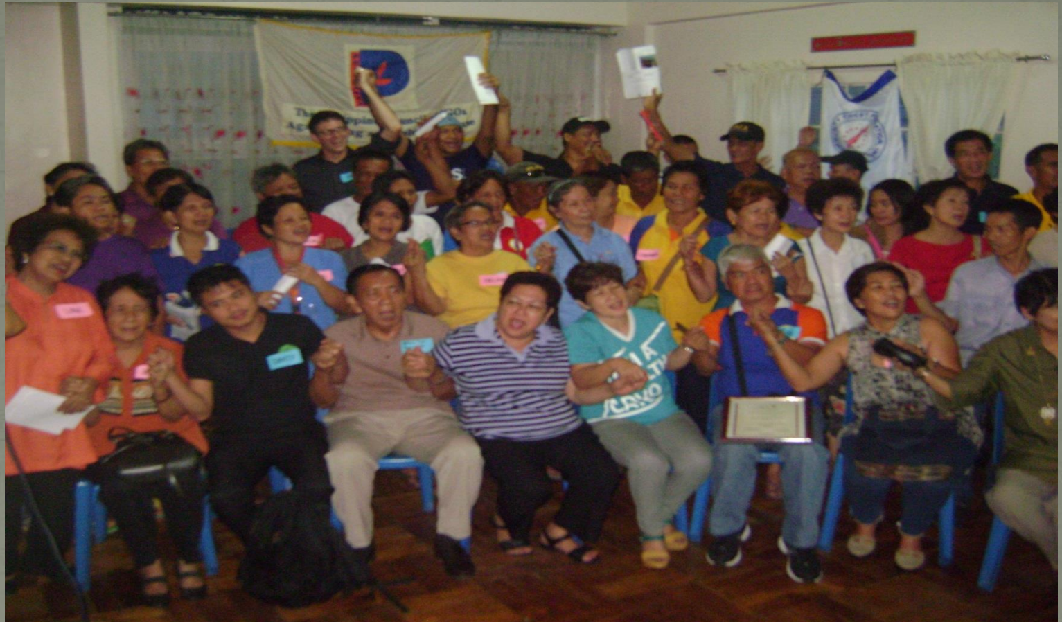
At day's end, a yakky pose.