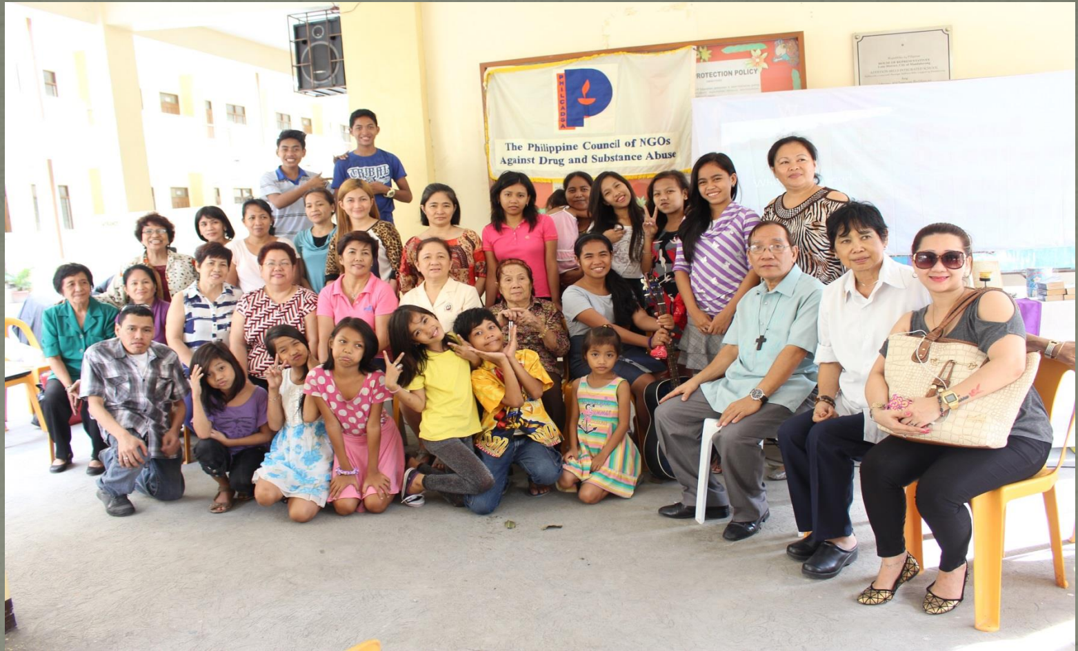
The intergenerational group learning together.