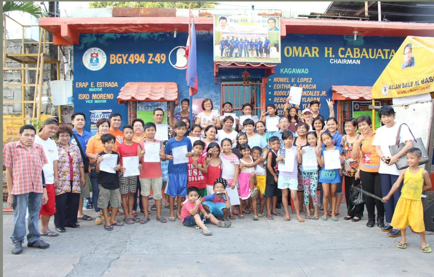
The products of the classroom along the road.