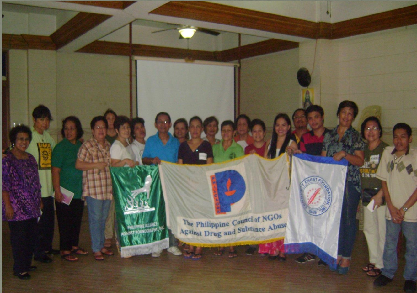
The participants behind the banners.